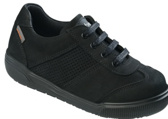
School Type Shoes