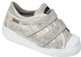
Fashion Low-Cut Shoes