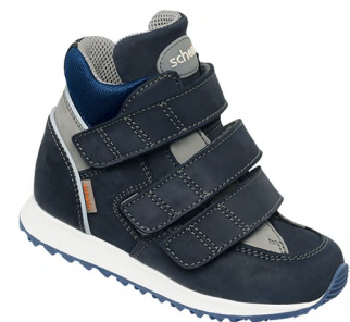
Extra Wide Hi-Cut Boots