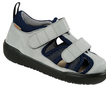
Closed Toe Sandals