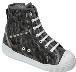
Trendy Hi-Cut Boots