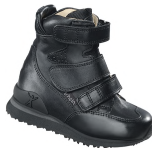
Support Hi-Cut Boots