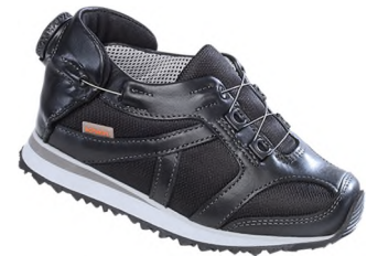
Boa Closure Shoes