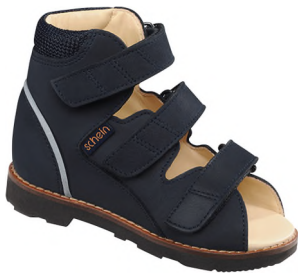
Open Toe Sandals